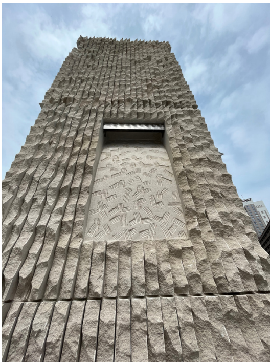
Rundel Terrace Revitalization Project

FFRPL is also the Founding Sponsor of Central's annual juried show, Art of the Book & Paper .