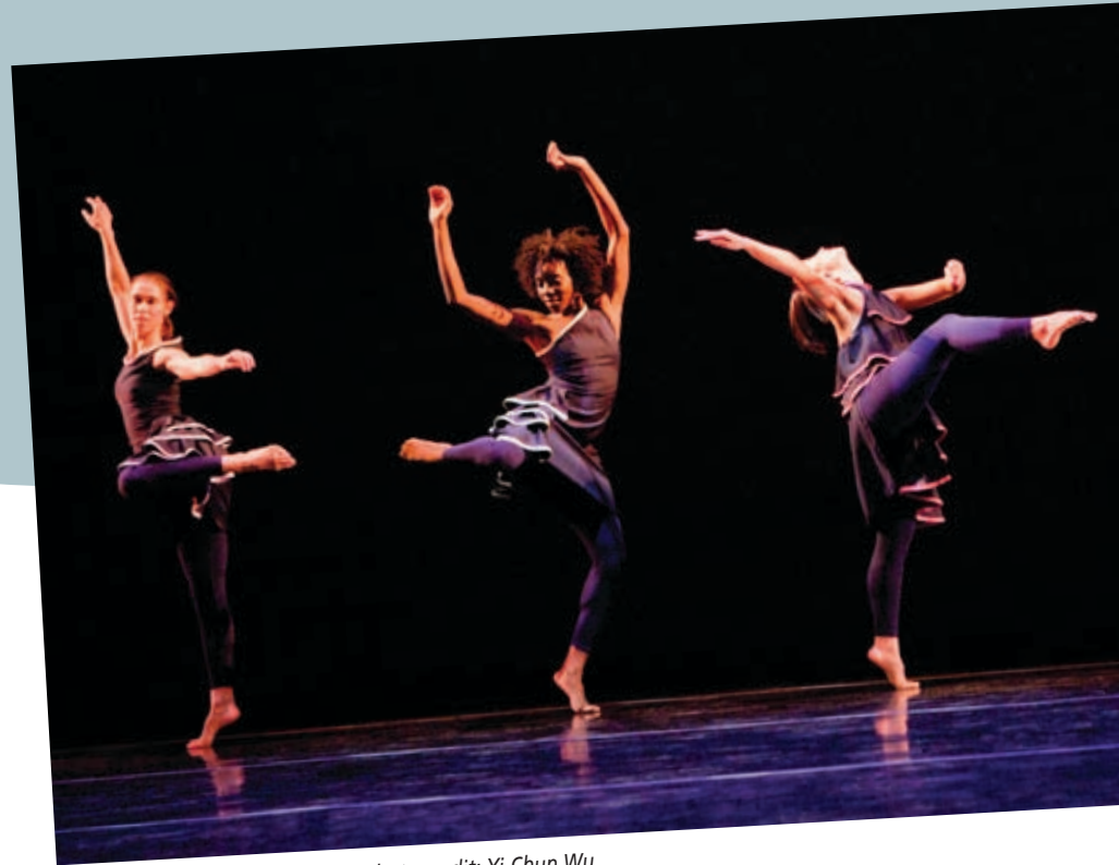
Thanks Forty Garth Fagan Dance.