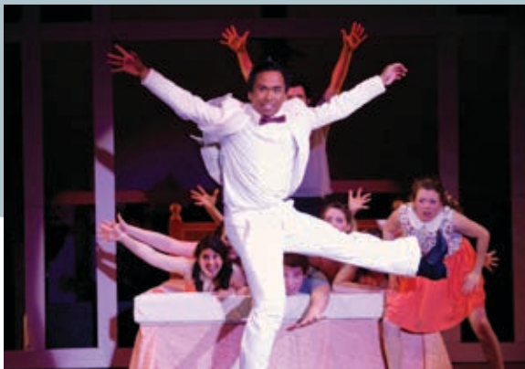
Babes in Arms.