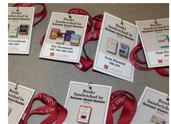
Books Sandwiched In 60th Anniversary

Last year, FFRPL celebrated 60 years of its legacy program Books Sandwiched In , and welcomed 40 BSI alumni reviewers to celebrate a yearlong look back at six decades of noon-time book reviews. More than 1000 people attended the Spring and Fall BSI series (with hundreds more viewing remotely on YouTube and social media).