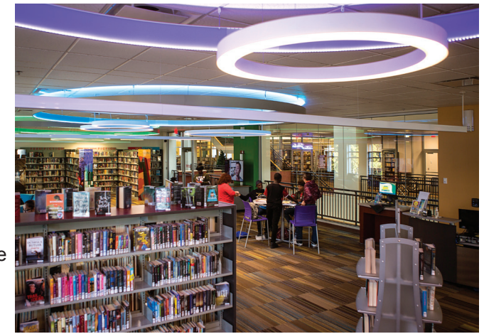
New Teen Central

With supplemental funds raised by FFRPL, the Rochester Public Library renovated about 16,000 square feet of space at Central Library in the Arts Division and about 11,000 square feet of space dedicated to Youth Services ( Teen Central, B Hive, and Middle Ground ).