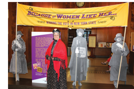
'Susan B. Anthony' at Central Library

FFRPL supported the 2017 Central Library exhibition, 'Because of Women Like Her... Winning the Vote in New York State' through grants, gifts and the Becker Fund for Local History. More than 28,000 visitors learned about the history of the women's suffrage movement, and traveling versions have been seen by thousands more throughout Monroe County.